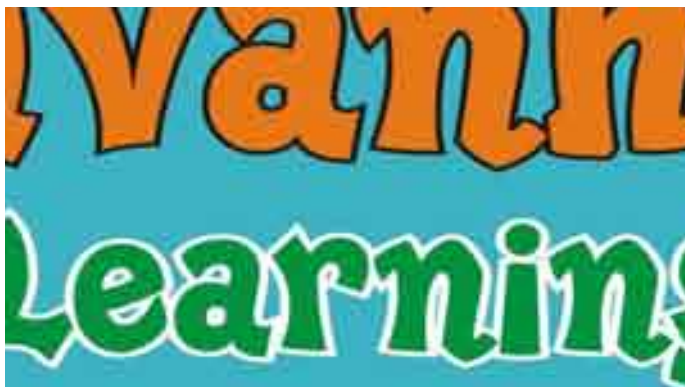
Image with hazing, ghost like areas